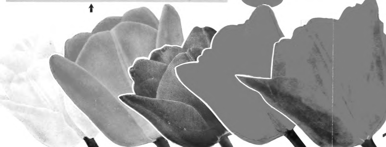
ZWANENBURG 12 for $1.10 PRINCESS ELIZABETH MAX 12 for $1.00 BLEU AIMABLE 12 for $1.00 GOLDEN AGE 12 for $1.10 FARNCOMBE SANDERS 12 for 85c

Collection K 10 bulbs each of 5 Darwin varieties illustrated below 50 for $3.80